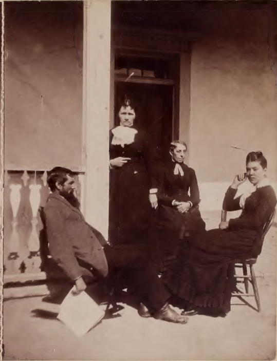
91-Teachers in the Indian School at Albuquerque, N. M.